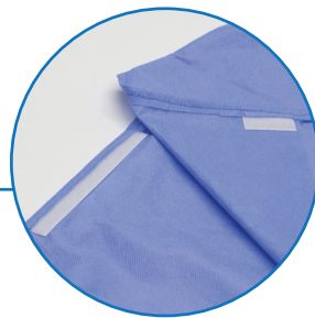
Hook and Loop